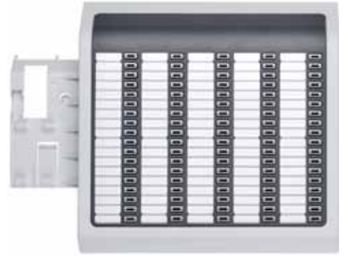
OpenStage busy lamp field (BLF) module 40

With 90 additional programmable function keys, it's ideal for attendant consoles monitoring time user status (e. g., available, busy)