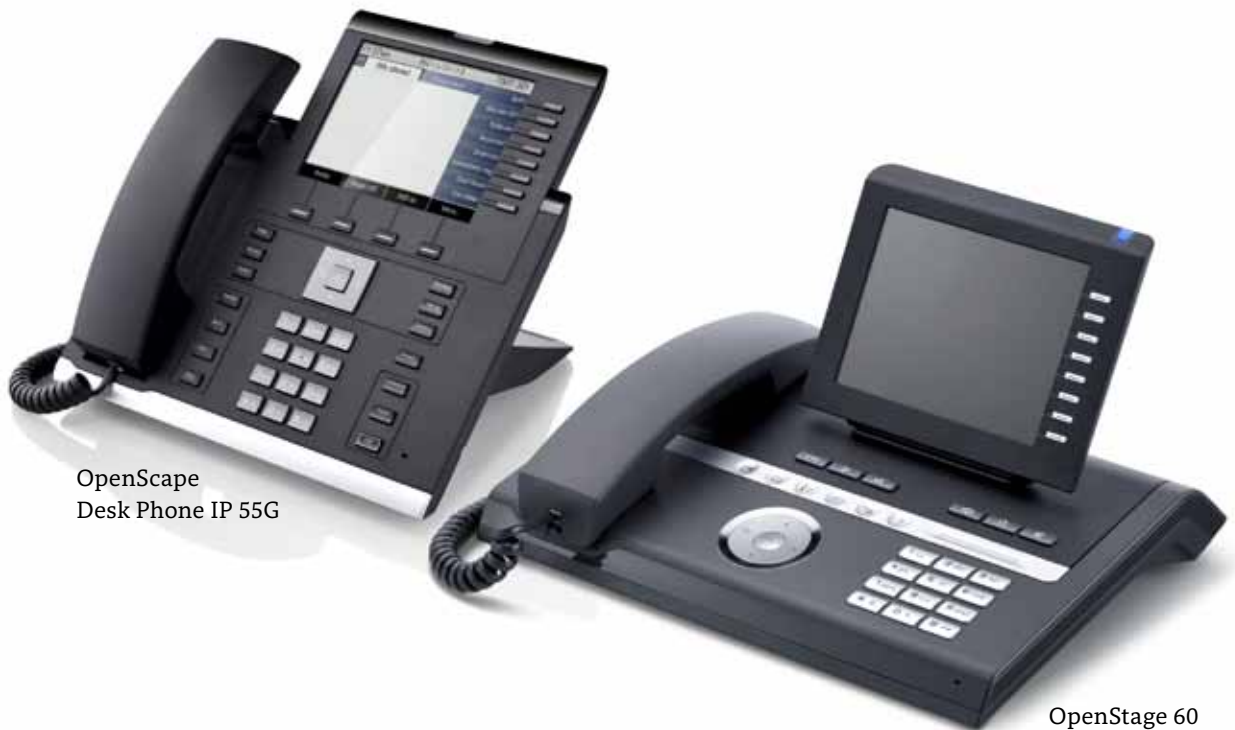
OpenScape Desk Phone IP 55G

Setting the benchmark for open, unified communications that boost productivity and streamline workflow with the most used office device - the telephone.