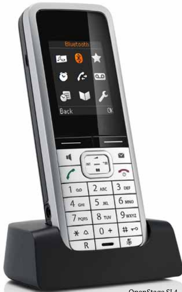
OpenStage SL4 professional

Unify gives you more competitive advantages with wireless solutions: