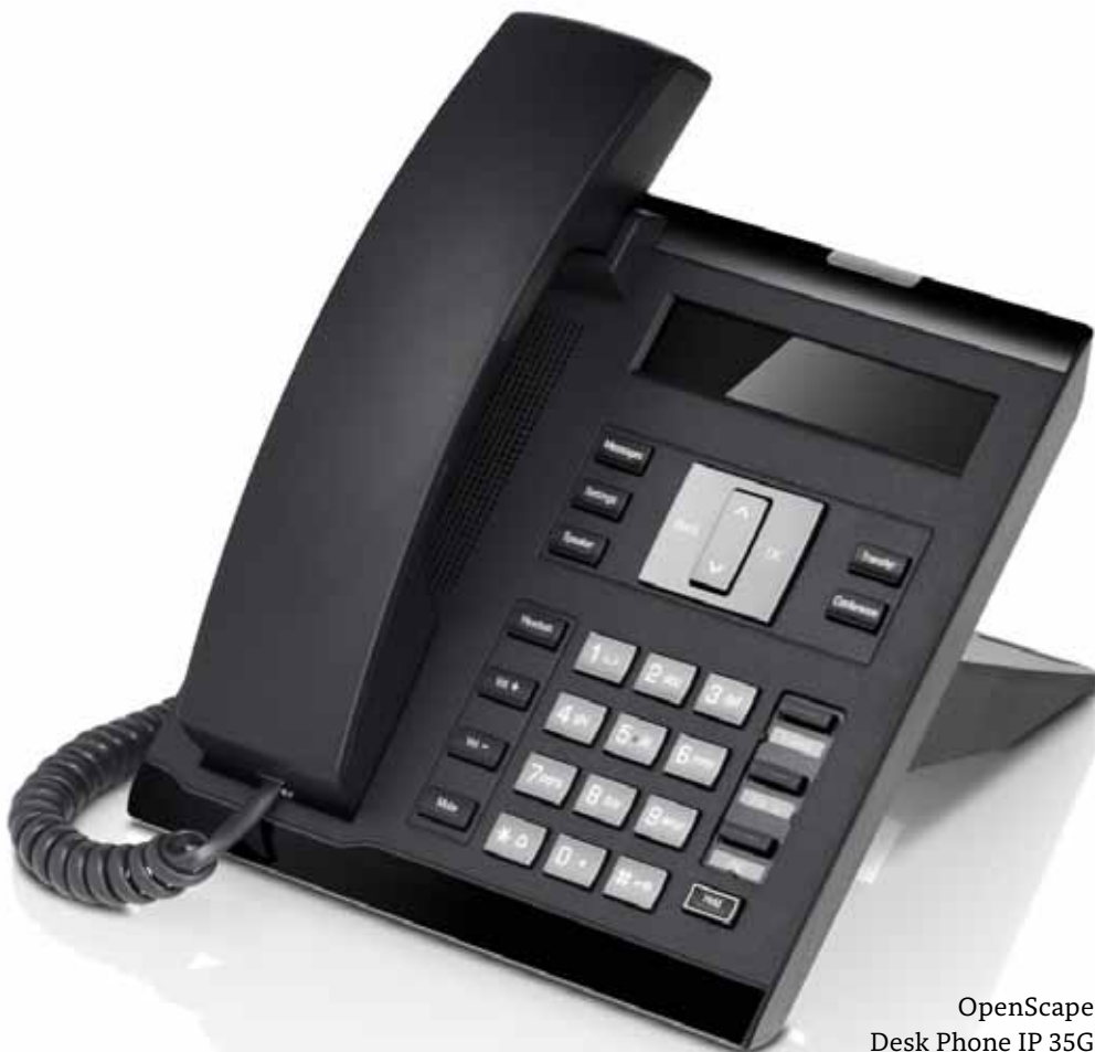
OpenScope Desk Phone IP 35G

Traditional Time Division Multiplexing (TDM) phones are targeted towards customers who wish to keep their current telephony solution, but want a high level of functionality and style.