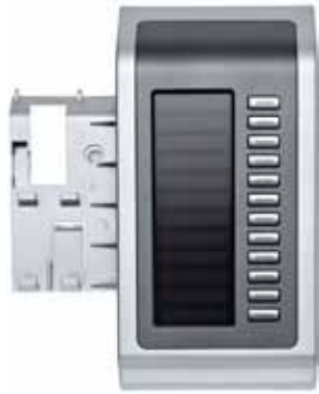
OpenStage key module 15, 40, 60, 80